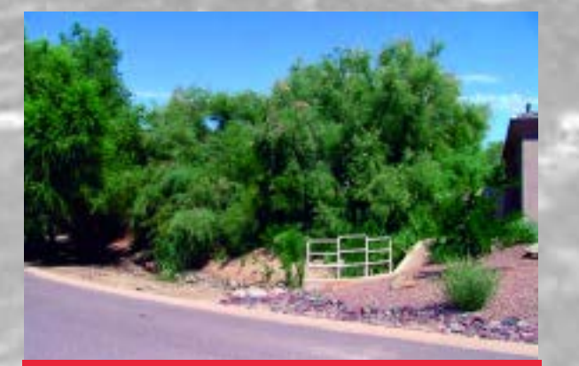
Overgrown trees and bushes provide fuel for wildfires.

Maintain a 15-foot zone around your home; thin dead and fallen vegetation, perennial grasses and overgrown bushes; remove dead branches or branches touchingthe ground. Thin another 15 feet of perennial grasses and annuals for maximum protection.